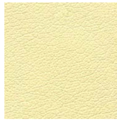
V2302 Butter Cream