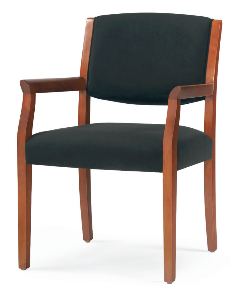
W 22½ H 34 D 25 AH 25 SH 19

Langton guest seating is crafted from the finest solid cherry and fully protected with a tough durable antimicrobial finish; specially formulated to withstand a broad range of stringent cleaning chemicals.