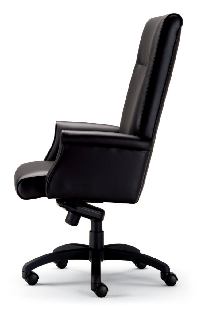
811-2 Tilt swivel W 26 H 47-50 D31 AH 26-29 SH 18-21 (Optional Polished Base)