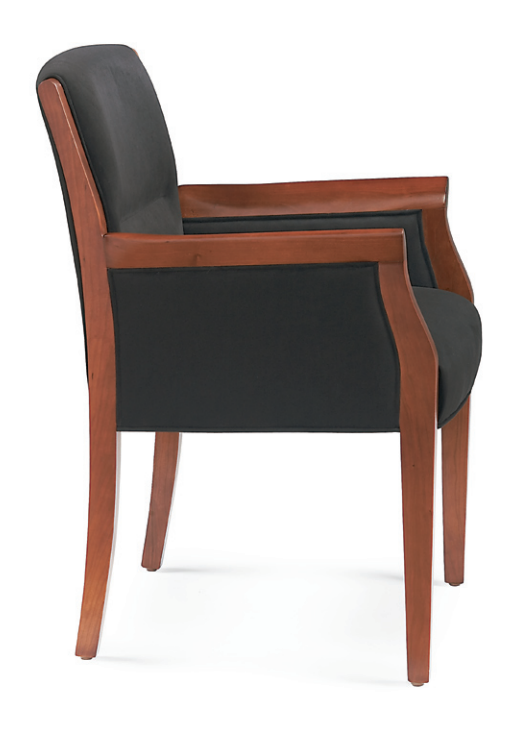
823 W 22½ H 34 D 24 AH 25 SH 19