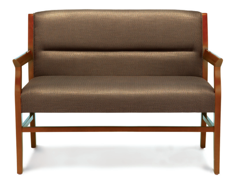
824-X Bariatric chair W 32½ H 34 D 24 AH 25 SH 19