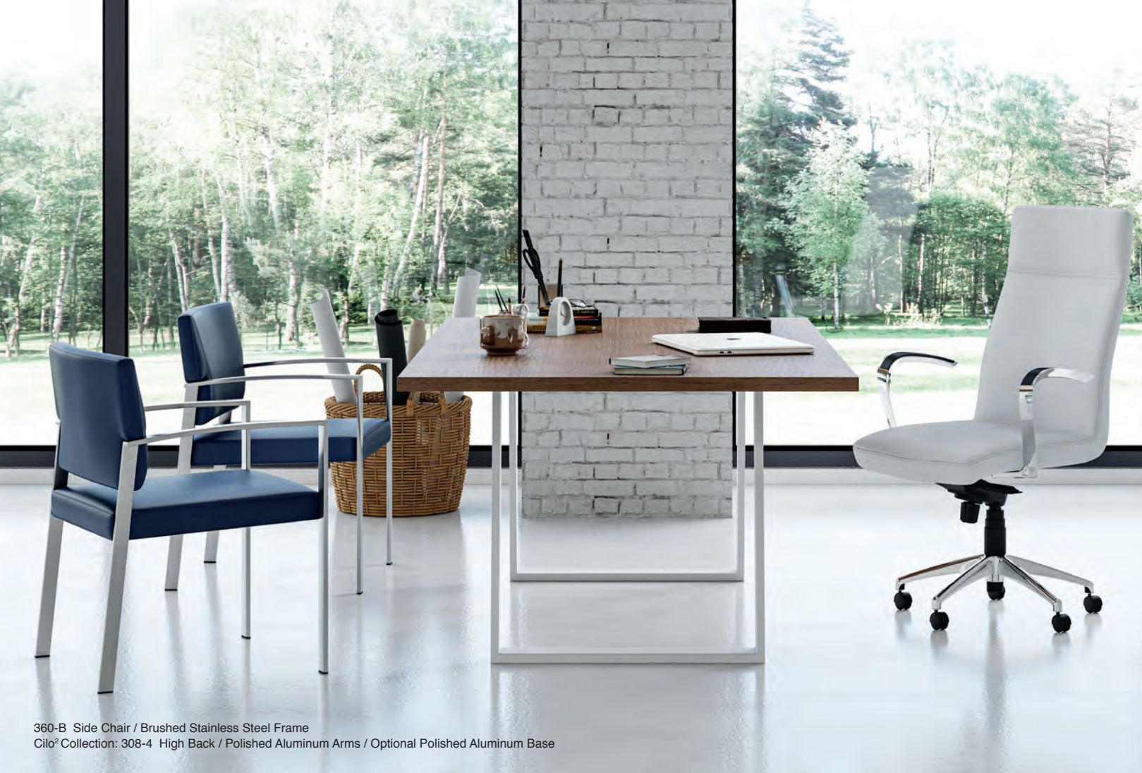
360-B Side Chair / Brushed Stainless Steel Frame Cilo 2 Collection: 308-4 High Back / Polished Aluminum Arms / Optional Polished Aluminum Base