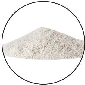
Additional Weight (sand bag)