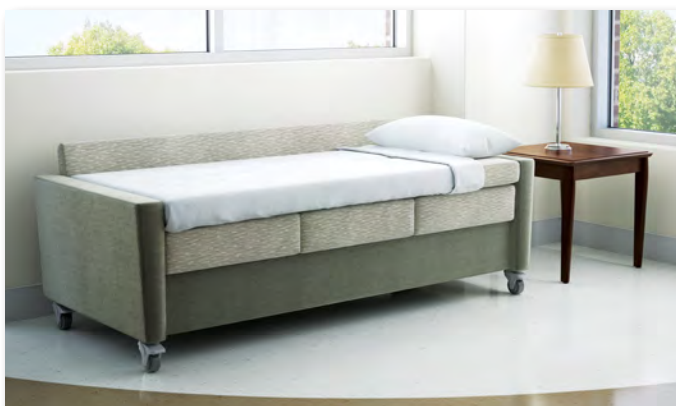
Healthcare Family Respite