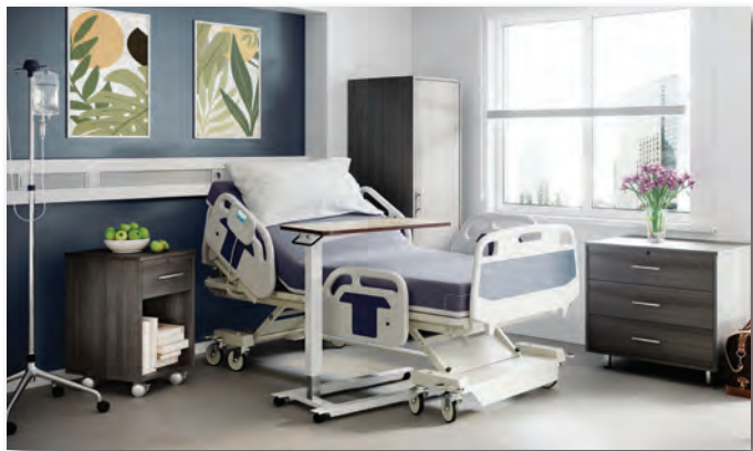
Healthcare Patient Room