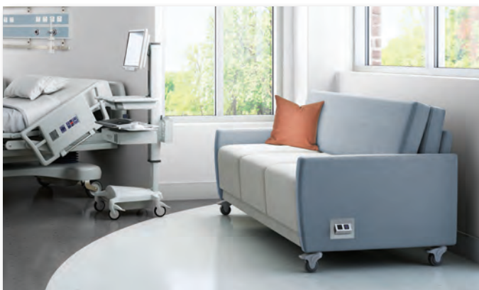
Healthcare Family Respite