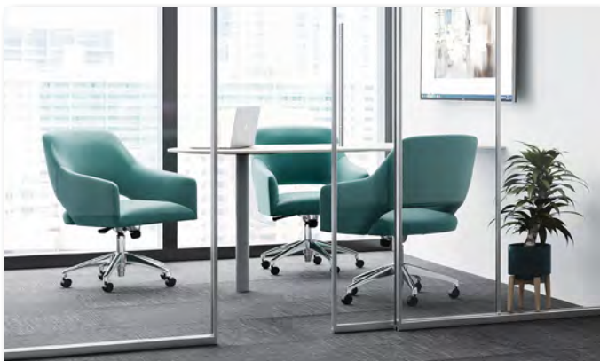
Conference & Waiting