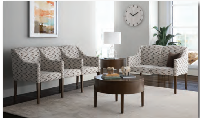
Lounge & Waiting