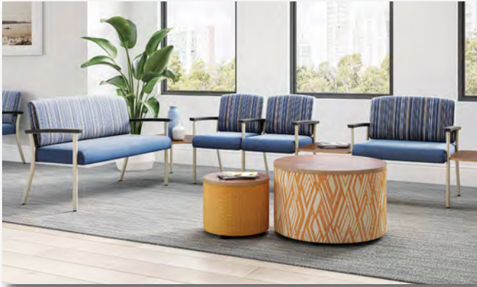
Lounge & Waiting