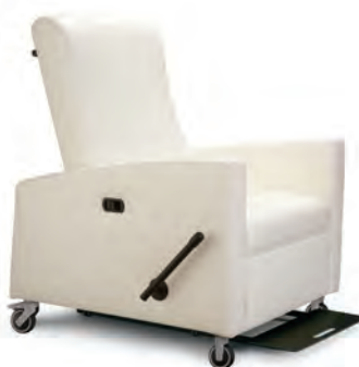
1513 Replay Medical Recliner