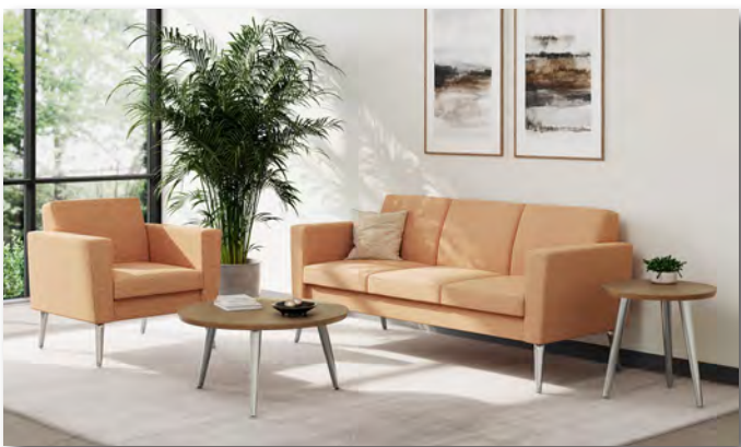
Lounge & Waiting