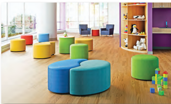
Nursery & Daycare