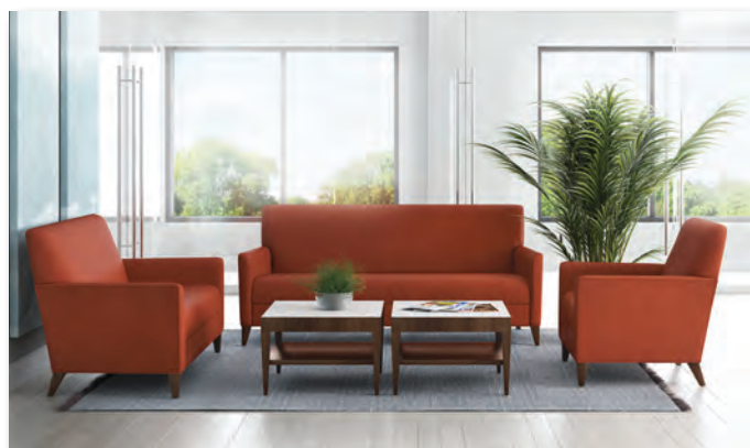
Lounge & Waiting