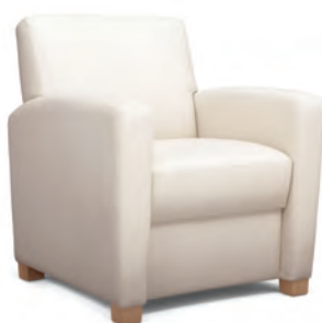
1501 Replay Lounge

Our Facelift family of products feature upholstery that attaches with Velcro - simply peel off and replace anytime! No tools are needed. A special antimicrobial moisture barrier fully encapsulates the seat, back, and arms, keeping your furniture well-protected. Facelift furniture is made with a strong hybrid frame of steel and plywood that supports up to 1,000 pounds. All components can be replaced easily on-site, including upholstery covers, seat and back cushions, legs and frame components, and seat suspension. All Facelift products come with a lifetime warranty and are proudly made in the U.S.A.