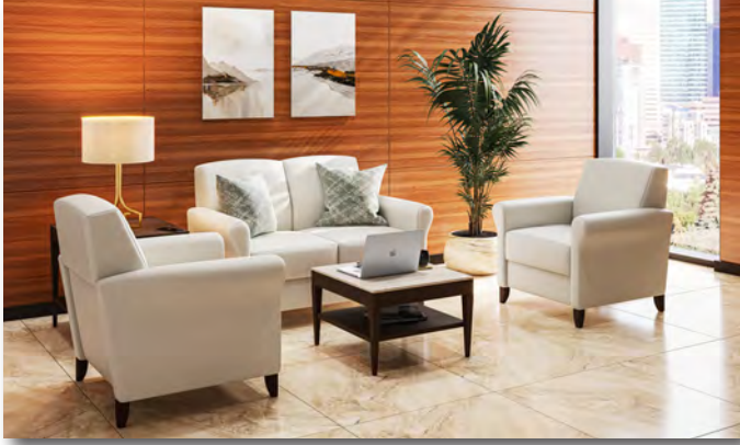
Lounge & Waiting