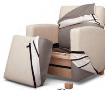
Standard Removable Covers