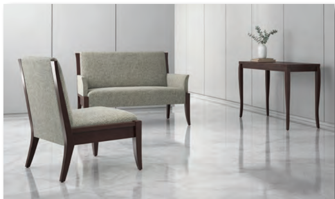
Lounge & Waiting