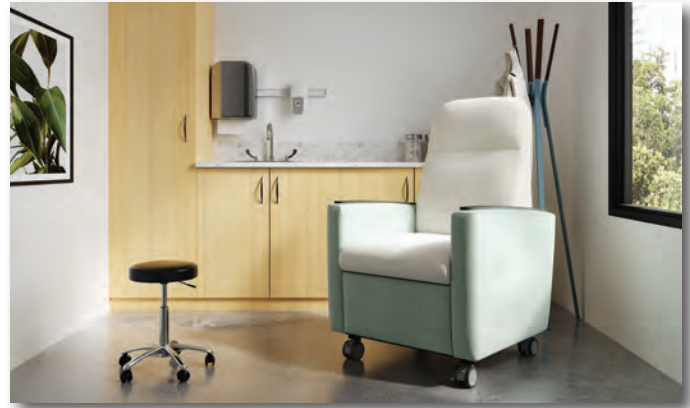
Healthcare Treatment Area