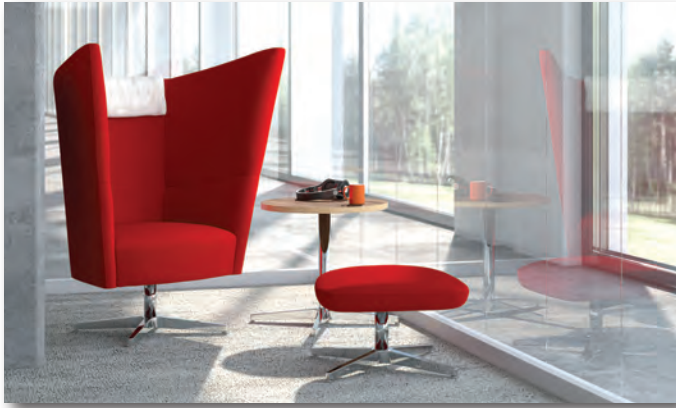
Corporate Privacy Area