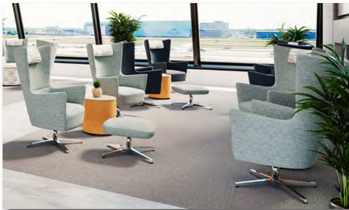
Airport Terminal Waiting Area