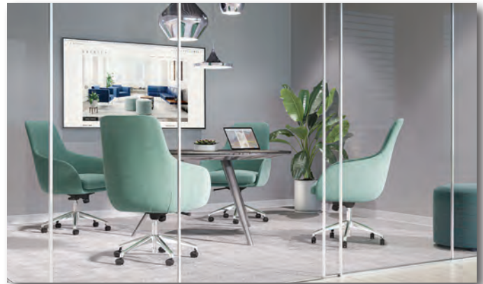
Meeting & Collaborative Space