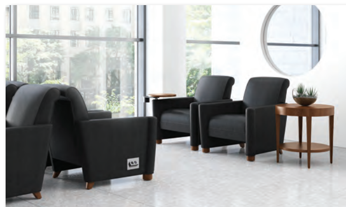
Lounge & Waiting