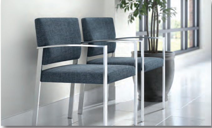
Lounge & Waiting