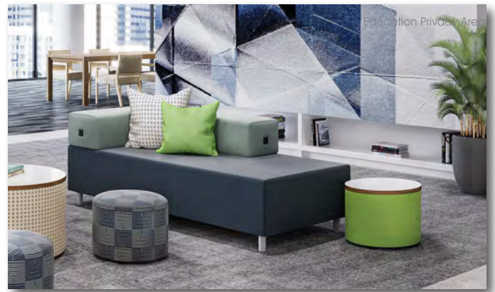
Lounge & Waiting