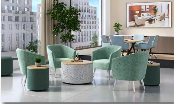
Conference & Waiting