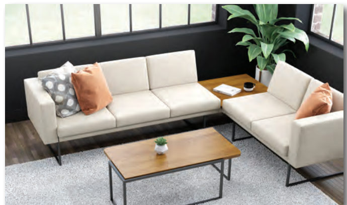
Education Student Union