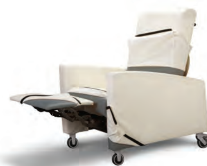
Standard Removable Covers