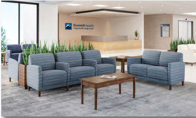
Lounge & Waiting