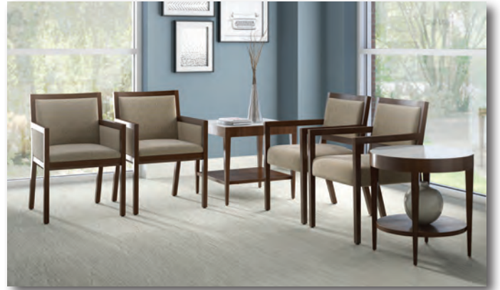
Lounge & Waiting