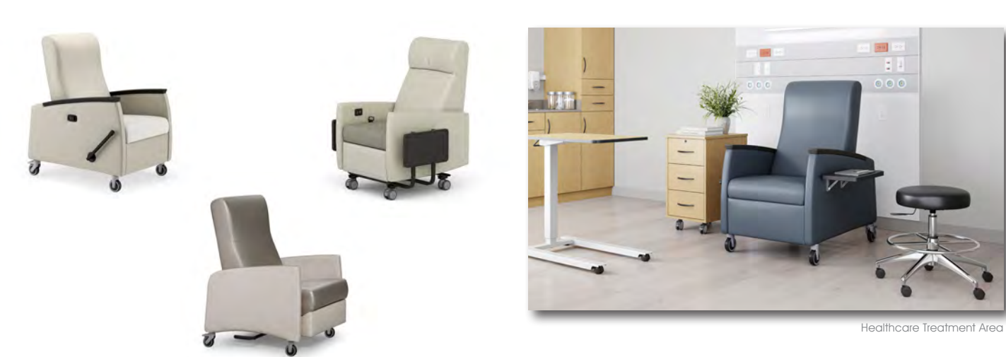
Healthcare Treatment Area