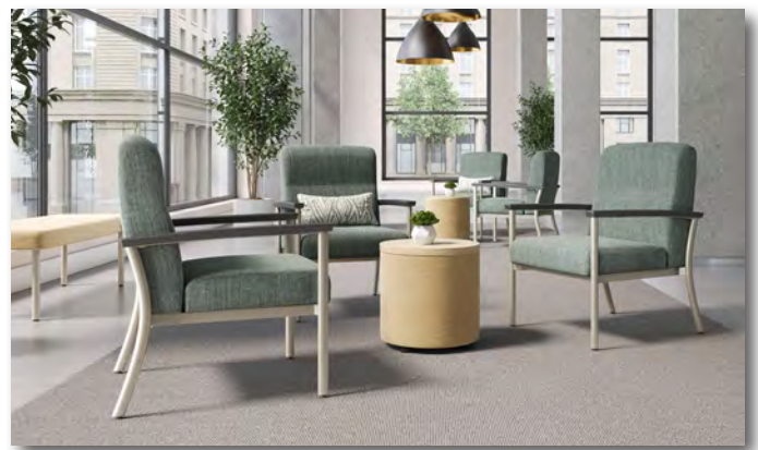
Lounge & Waiting