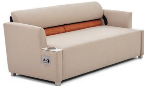
Sleep Area: W 76" D 30" *Optional Power / Data Ports (Left / Right)