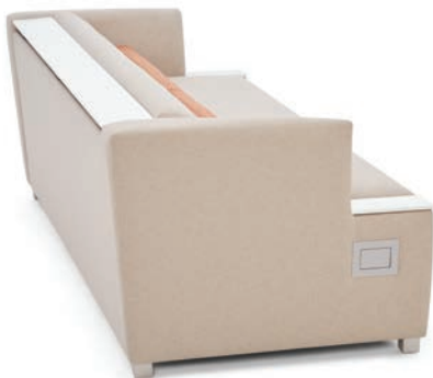
*Optional Integrated Corian Arm & Back Shelf Surfaces