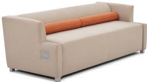
Closed Position: W 87" D 36" H 28" SH 18"