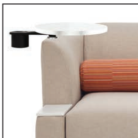
*Optional Corian Tablet Arm w/ 360° Rotation / Cup Holder (Also Available In Laminate / Veneer)