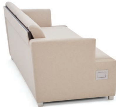
*Standard Integrated Upholstered Arm & Back Shelf Surfaces