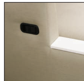
*Optional Central Breaking

Our Tuxedo Lounge reveals a fully suspended adult sleep surface by simply raising the back cushion; a transformation requiring no additional space in the patient room. Additional space-saving features include integrated arm and back shelf surfaces and easy access power/data ports. And to insure long and hygienic service, the removable seat upholstery is Velcro attached over a fully encapsulating antimicrobial moisture barrier. All Trinity products are proudly made in the USA and are certified: BIFMA Level Sustainability Standard.